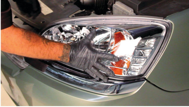
5) Seat the Spyder headlight.