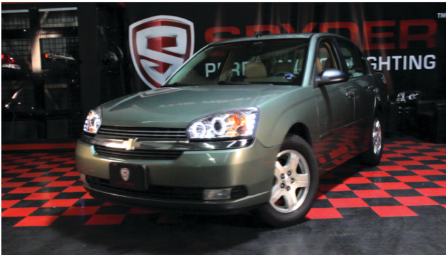
7) Close the hood and enjoy your new Spyder headlights.