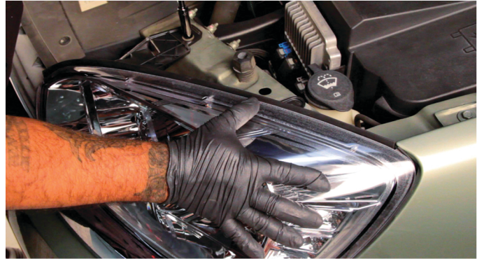
6) Reinstall [2x] 10mm bolts to mount the headlight.