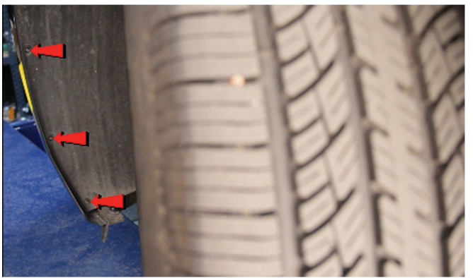
5) Remove [3x] T-15 Torx screws that secure the fender liner to the fascia.