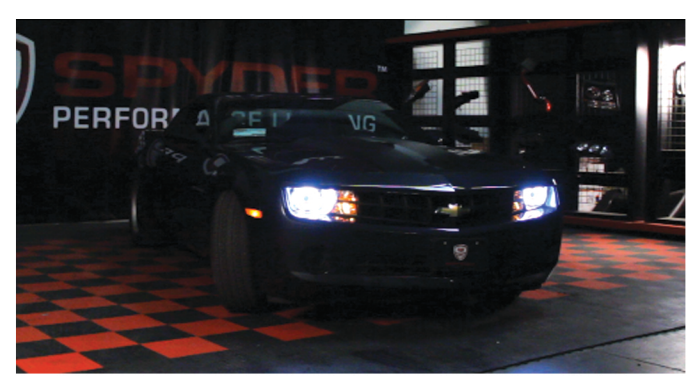
40) Reinstall [1x] 10mm bolt to secure the fascia to the fender.