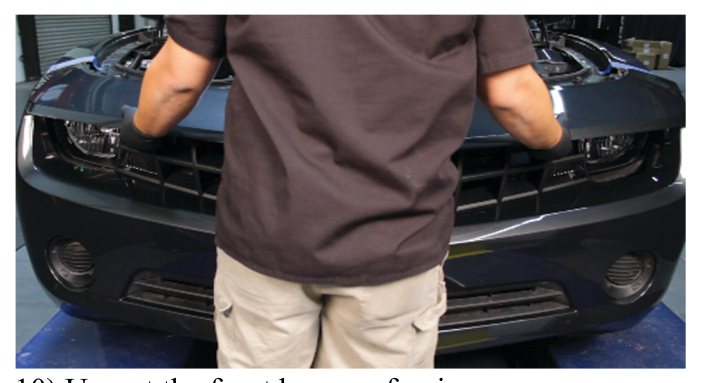
10) Unseat the front bumper fascia.