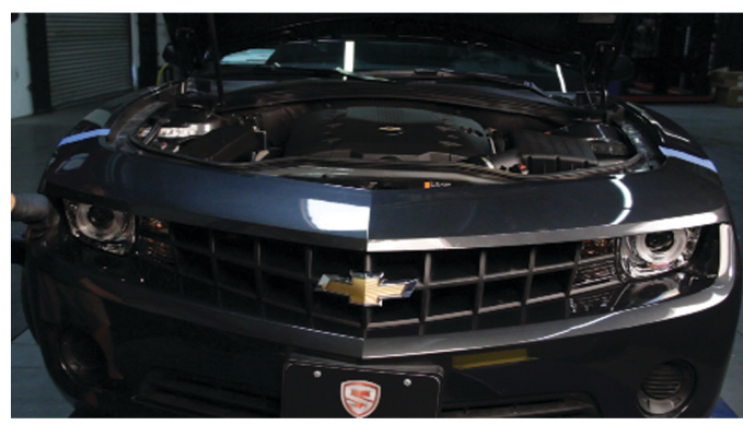
32) Seat the front bumper fascia.