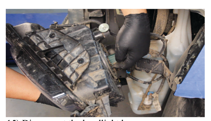
15) Disconnect the headlight harness.