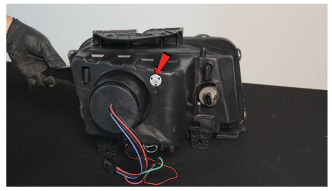
19) Your beam adjuster uses a phillips head screwdriver. For information on how to wire the halos and more, see the Spyder FAQs playlist on YouTube.