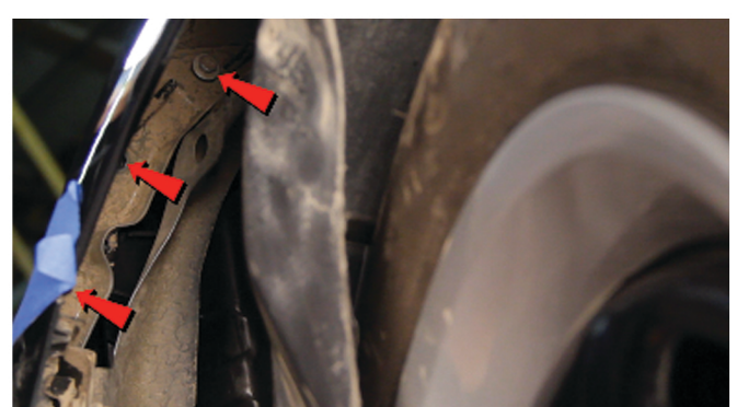
33) Reinstall [3x] 10mm bolts that secure the fascia to the fender from inside.