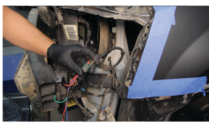
20) Reconnect the headlight wiring harness.