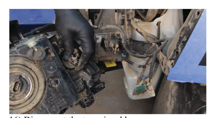
16) Disconnect the turn signal harness.