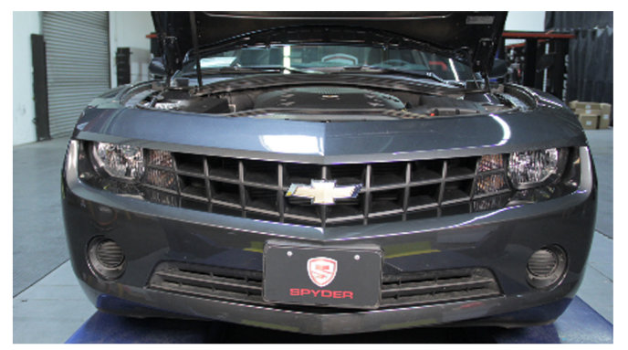
1) Open the hood.

If you are unfamiliar with the installation processes, professional installation is highly recommended.