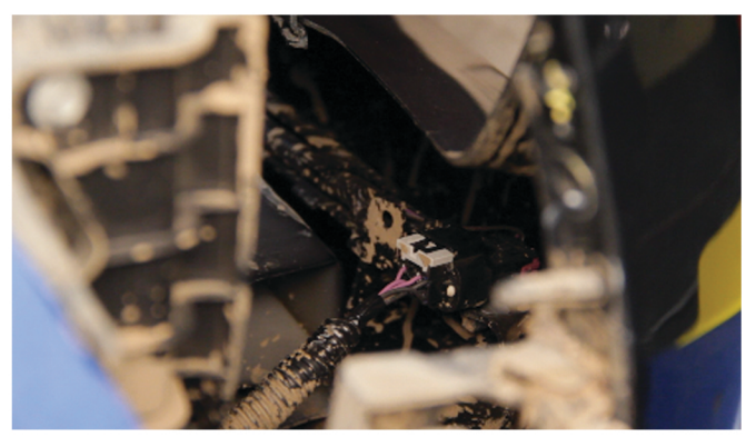
31) Reconnect the sidemarker/foglight harness master disconnect.