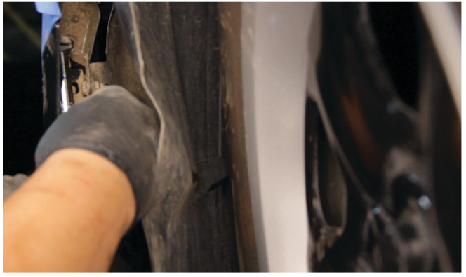
35) Reinstall [1x] 7mm bolts to secure the fascia.