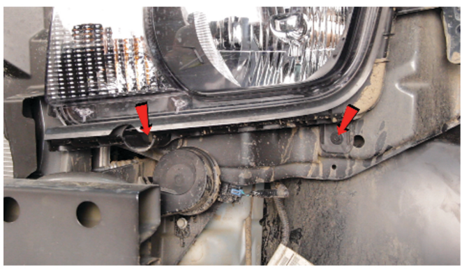
13) Remove [2x] 7mm bolts securing the headlight from below.