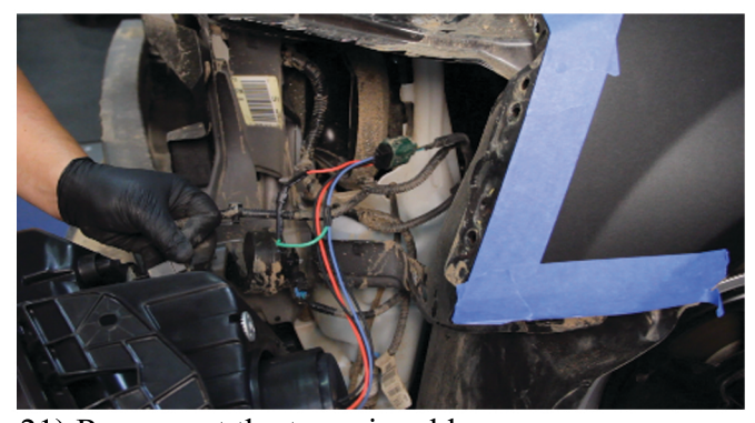
21) Reconnect the turn signal harness.