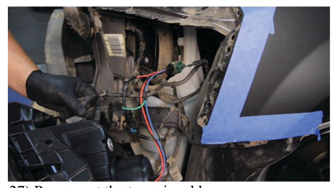
27) Reconnect the turn signal harness.