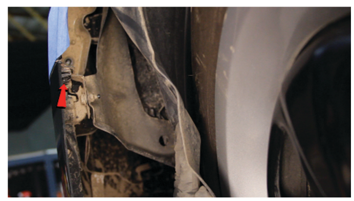
8) Remove [1x] 7mm bolt that secures the fascia to the fender.