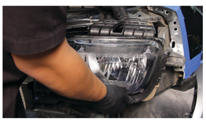
14) Unseat the OEM headlight.