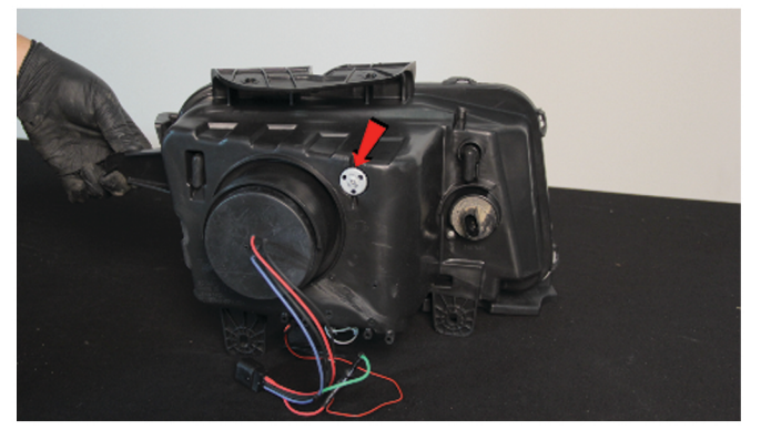
25) Your beam adjuster uses a phillips head screwdriver. For information on how to wire the halos and more, see the Spyder FAQs playlist on YouTube.