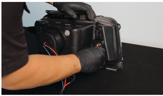
24) Reinstall [3x] 10mm bolts to mount the headlight.