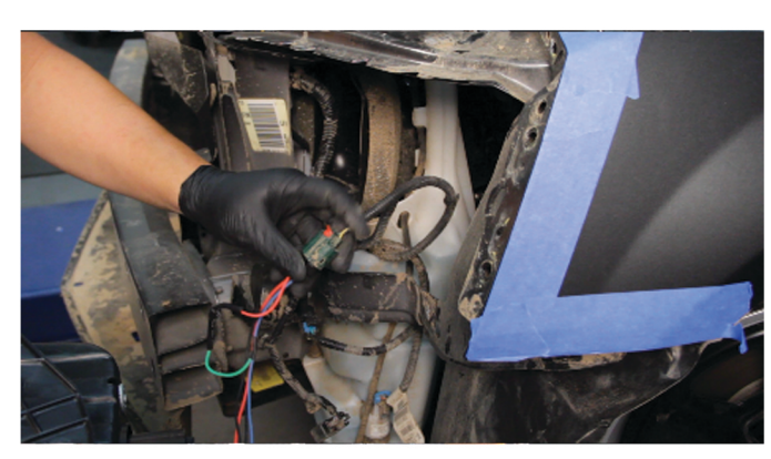
26) Reconnect the headlight wiring harness.