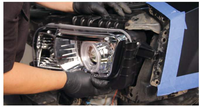
22) Seat the Spyder headlight.