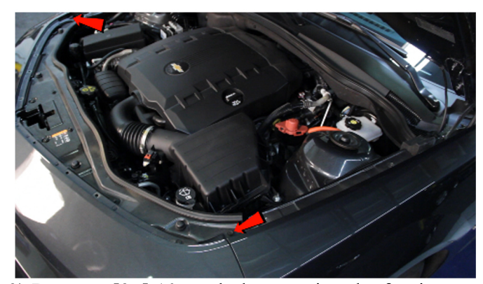
3) Remove [2x] 10mm bolts securing the fascia at the fender edge.