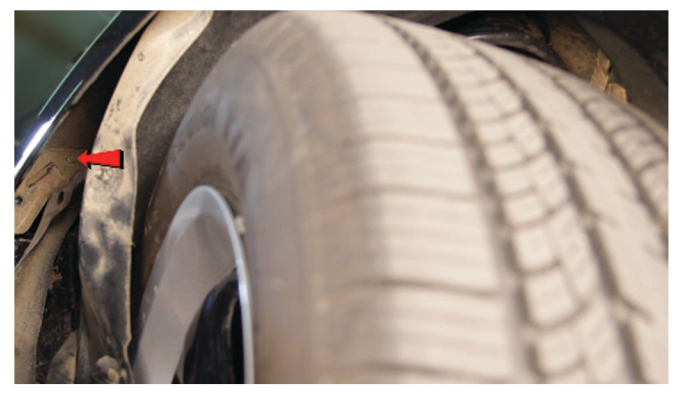
7) Remove [1x] 10mm bolt at the top that secures the fascia to the fender.