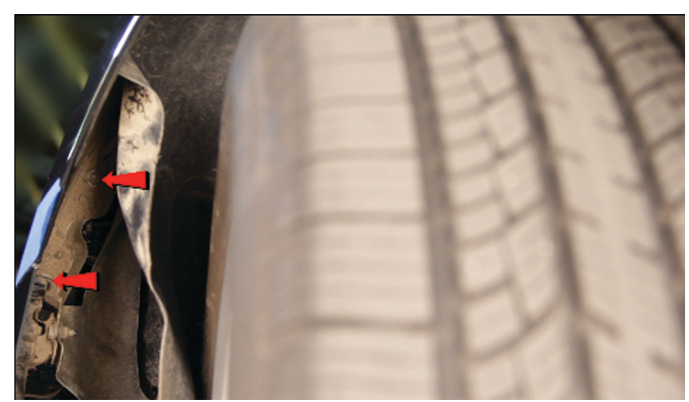
6) Remove [2x] 10mm Bolts that secure the fascia to the fender from inside the fender.