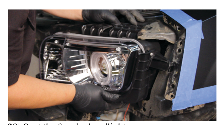
28) Seat the Spyder headlight.