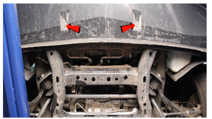
4) Remove [2x] 10mm bolts securing the fascia from below.