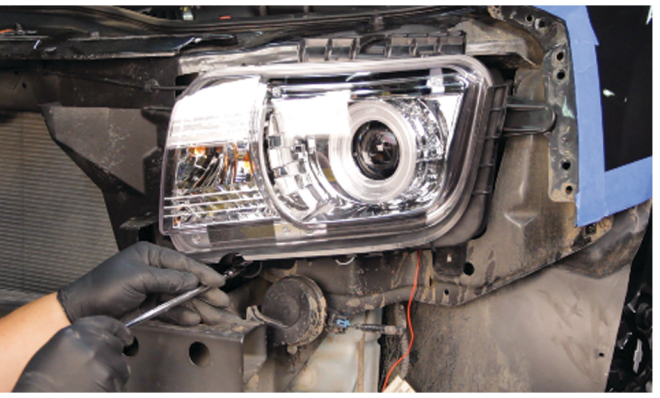
29) Reinstall [2x] 7mm bolts to secure the headlight.