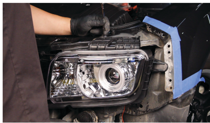
30) Reinstall [2x] 7mm bolts to mount the headlight.