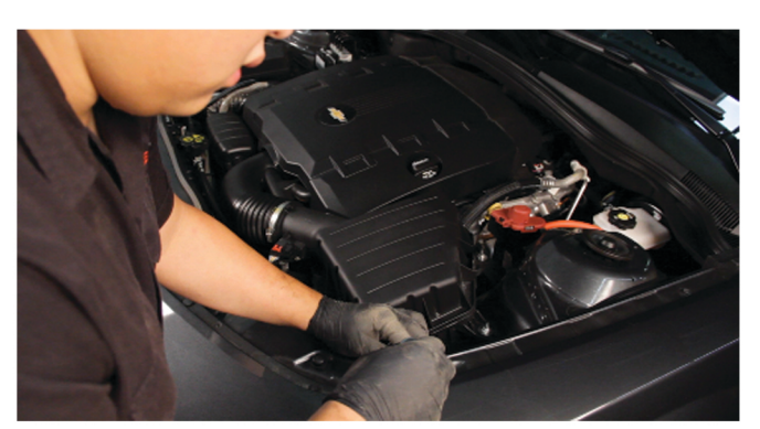
39) Reinstall [2x] 10mm bolts that that secure the fascia to the fenders.