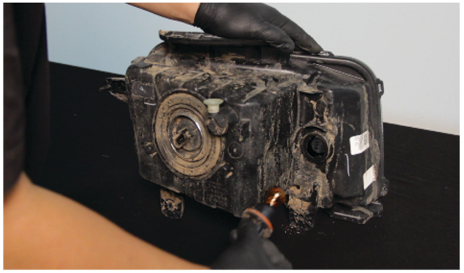
17) Seat the Spyder headlight, being sure the retainer tabs snap into place.