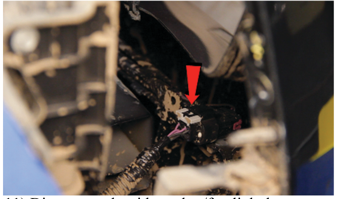
11) Disconnect the sidemarker/fog light harness master harness disconnect on the passenger side.