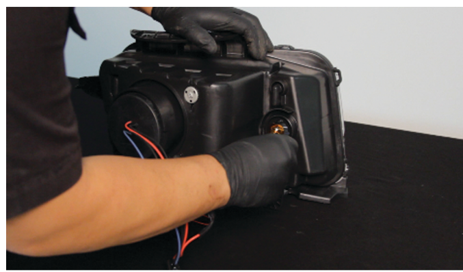
18) Reinstall [3x] 10mm bolts to mount the headlight.