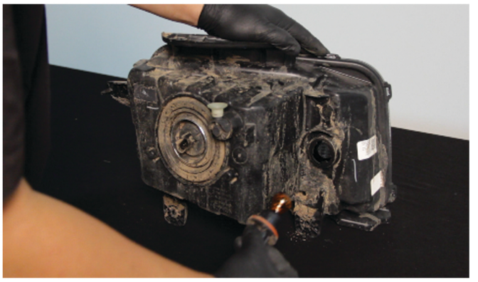
23) Seat the Spyder headlight, being sure the retainer tabs snap into place.