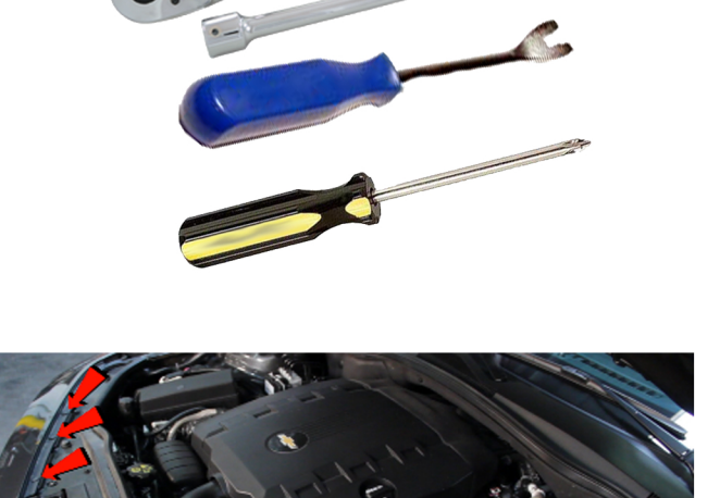
2) Remove [6x] plastic retainers securing the fascia.