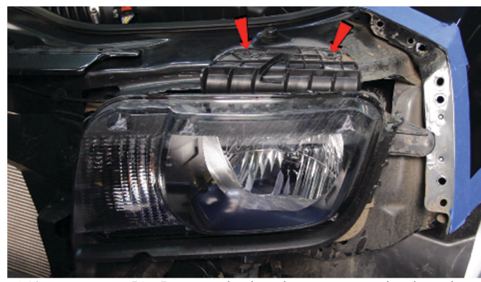
12) Remove [2x] 7mm bolts that secure the headlight from above.