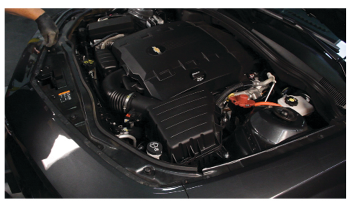
38) Reinstall [6x] plastic retainers along the header panel to secure the fascia.